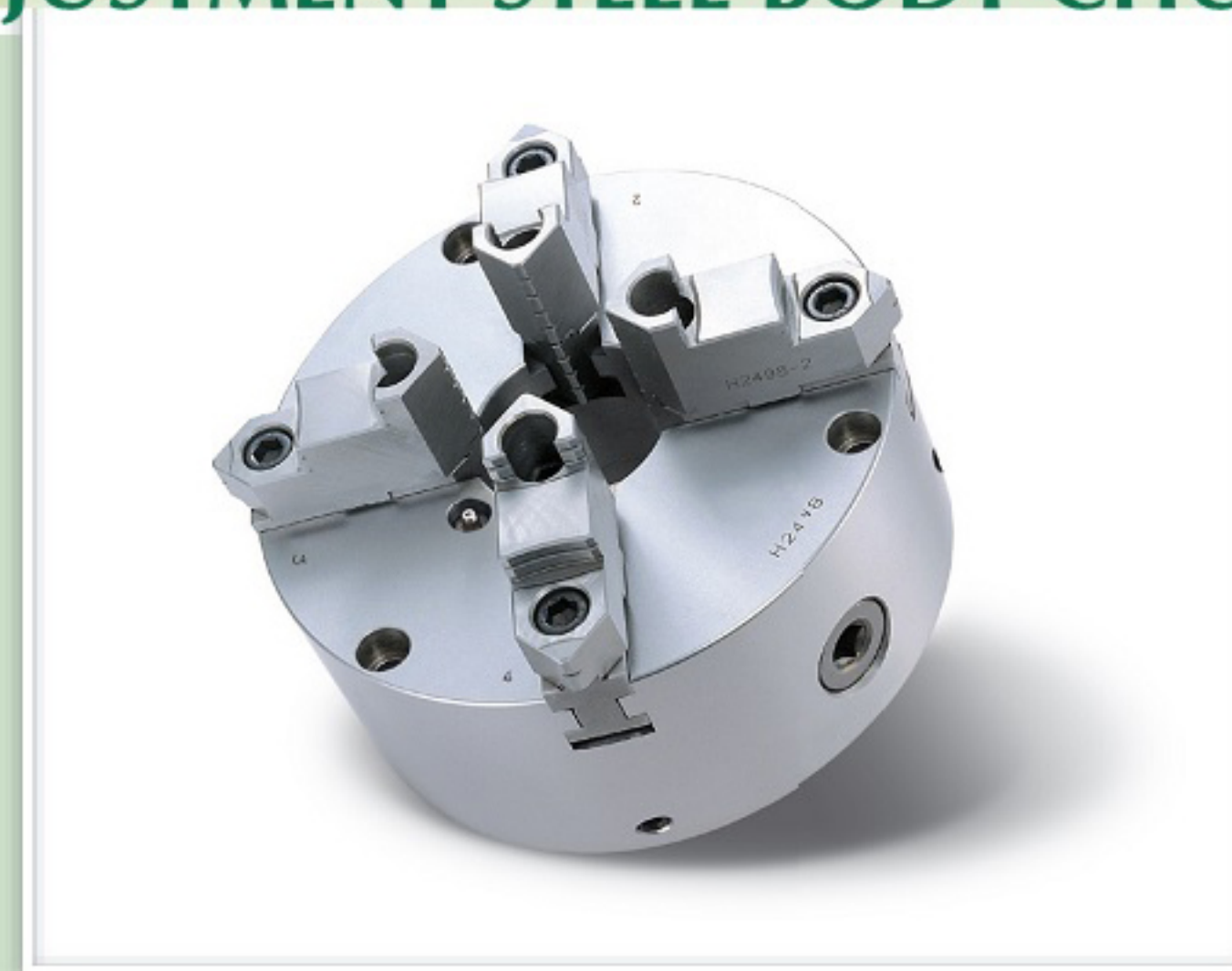
規格表 » Specifications